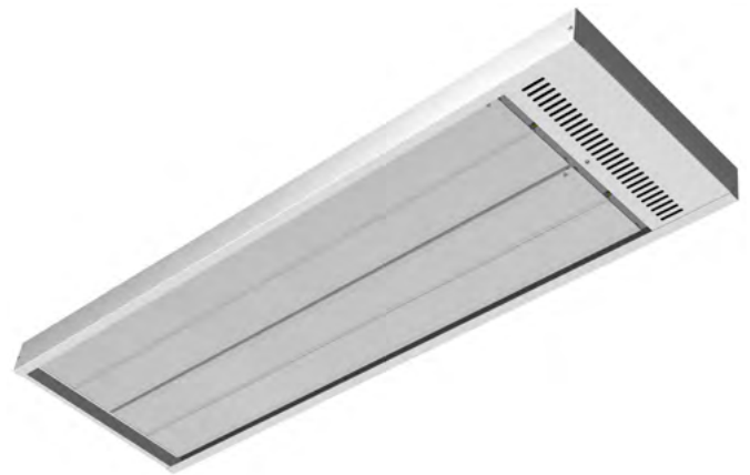
Frenger ES Radiant Heater

Frenger ES emits a gentle, pleasant radiant heat (infrablack, long wave), not to be confused with high-temperature shortwave infrared heat. The product is consequently ideal to use for general heating of small or large areas where installation heights are between 2-40m from floor height.